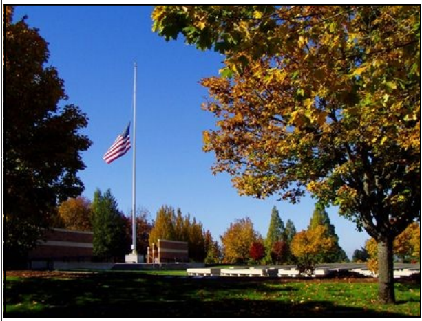
Amphitheater at Willamette National Cemetery

Portland - On Saturday, June 1st Company B, 71st Pennsylvania Volunteer Infantry, SVR will be providing the military honors at a funeral service for the unclaimed cremated remains of approximately 30 U.S. military