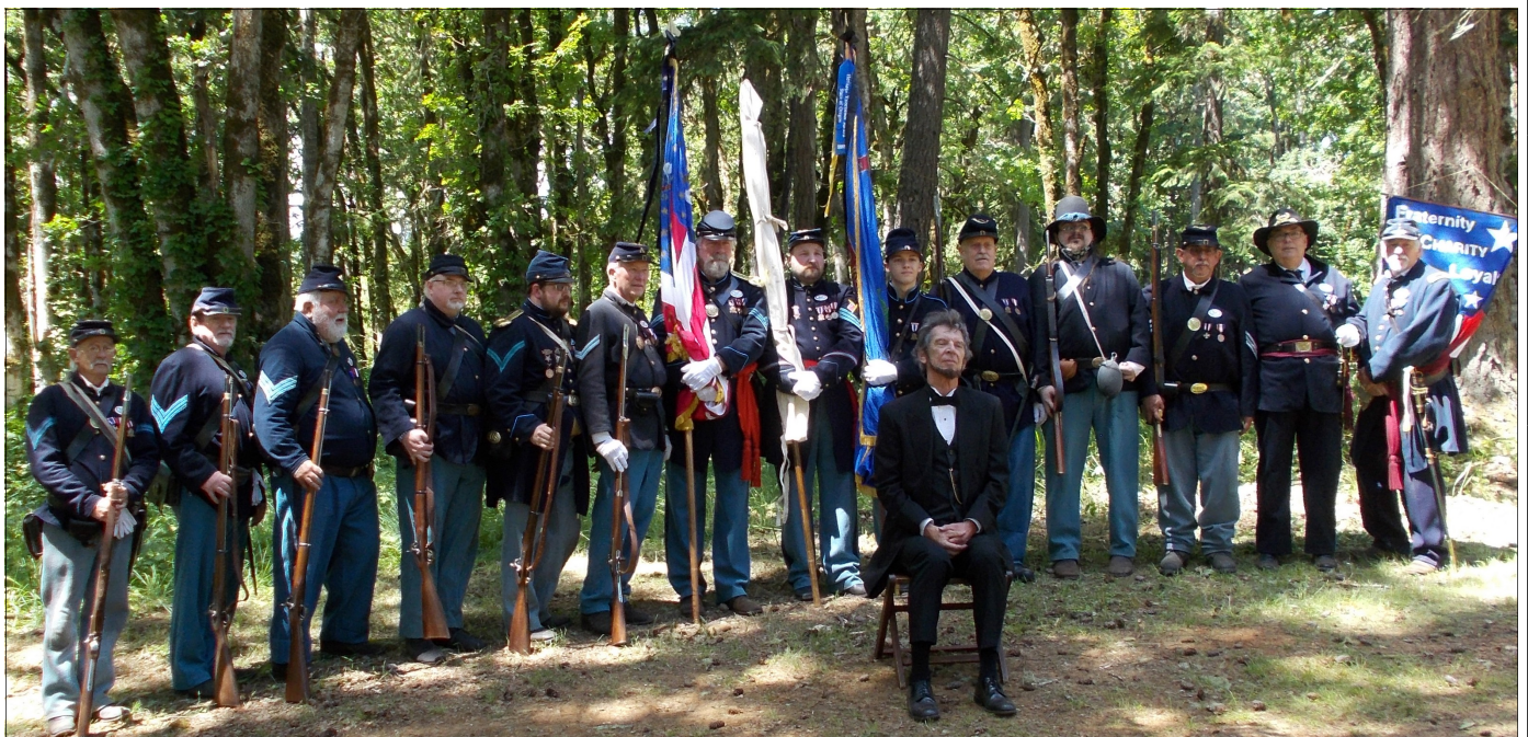
Company B, 71st Pennsylvania Volunteer Infantry, SVR - Memorial Day 2021 in Dallas, Oregon