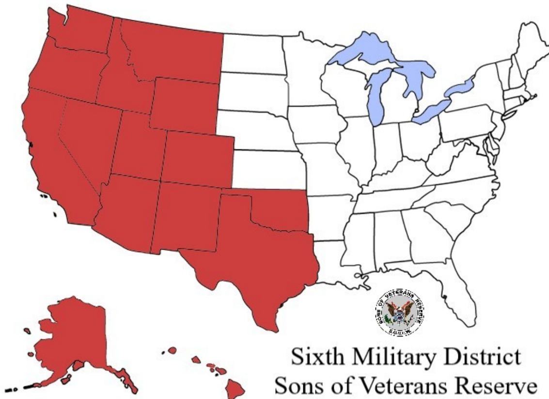
Sixth Military District Sons of Veterans Reserve