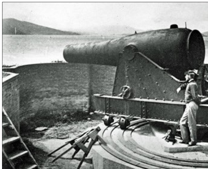
Soldier stationed at a mounted Rodman Gun at Fort Alcatraz during the Civil War.