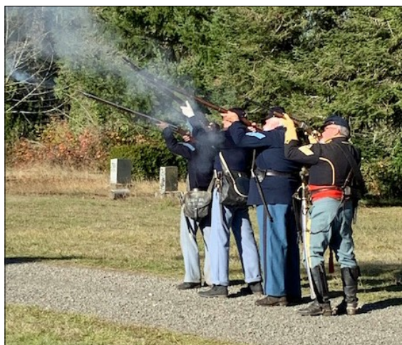
Musket salute at Oregon Remembrance Day. Company B 71st Pennsylvania Infantry, SVR.