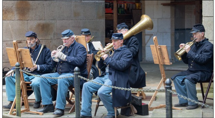
Fort Point Brass Band